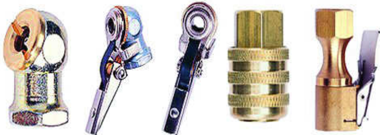
(1) AC12 (2) AC14 (3) AC14C (4) AC16 (5) AC18