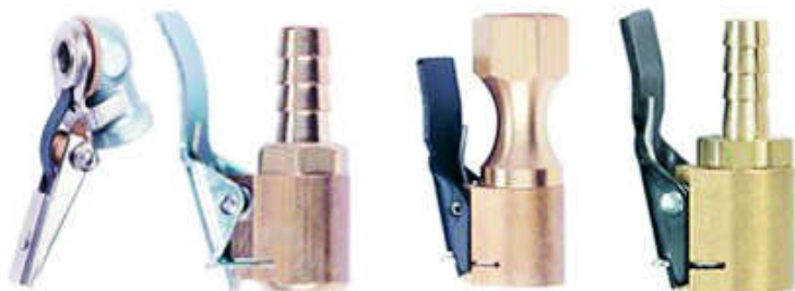
(6) AC14F (7) AC17F (8) AC18F (9) AC19F